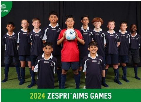
2024 ZESPRI™ AIMS GAMES