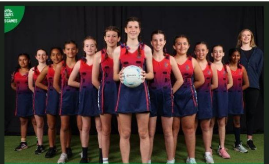
2024 ZESPRI™ AIMS GAMES