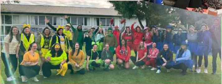
Cross Country 2024