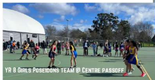
Yr 8 Girls Poseidons Team @ Centre Passoff

Our Yr 7 Girls Boeing team had 2 convincing victories to win their pool play. They then had another epic win in the quarter final against Scott Point before being beaten in the semi final to finish up 3rd = place out of 14 teams. Fabulous effort Boeings :)